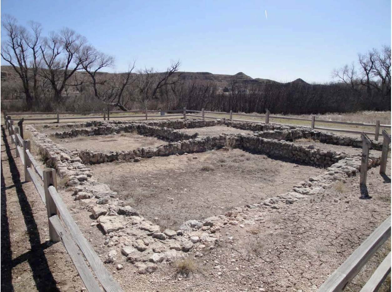
Attachment 3: El Quarteletejo ruins today, in dire need of conservation and protection.