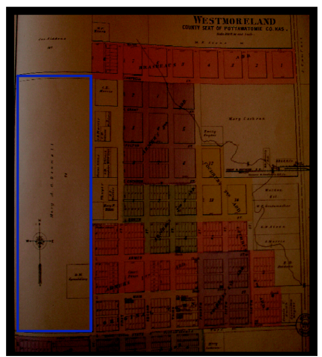
Figure 1. This is a map of Westmoreland, KS in 1900. The town is well established at this point and the area outlined in blue in the Common Pasture.

The subject referred to here is the Westmoreland common pasture located on the west side of Westmoreland, Pottawatomie County, Kansas, as seen in figure 1 below.<sup>2</sup>