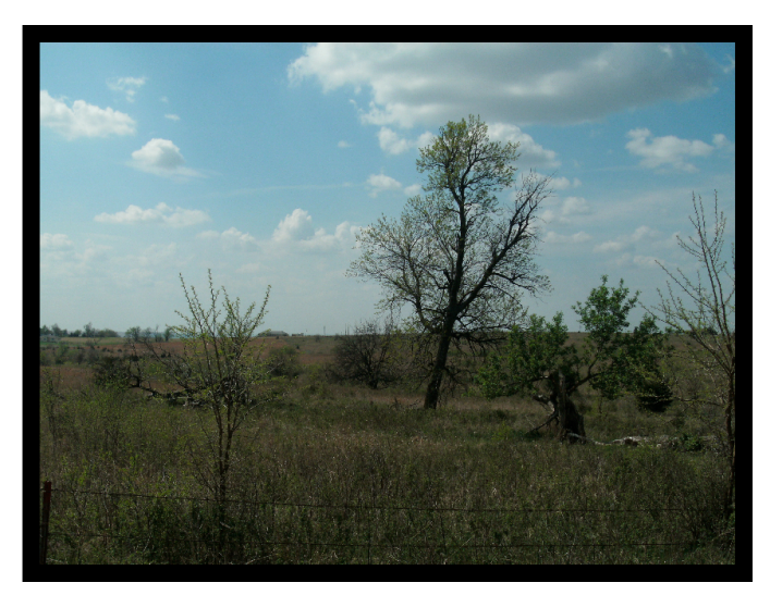
Figure 3. A current photograph of the north side of the Common Pasture facing south. Cottonwood and locust trees can be seen beyond a rusty barbed wire fence.

So the use of the common pasture finally ended when commercialized dairy operations took over, now it lays dormant, grown up with grass, weeds, and trees as shown in figure 3 below.