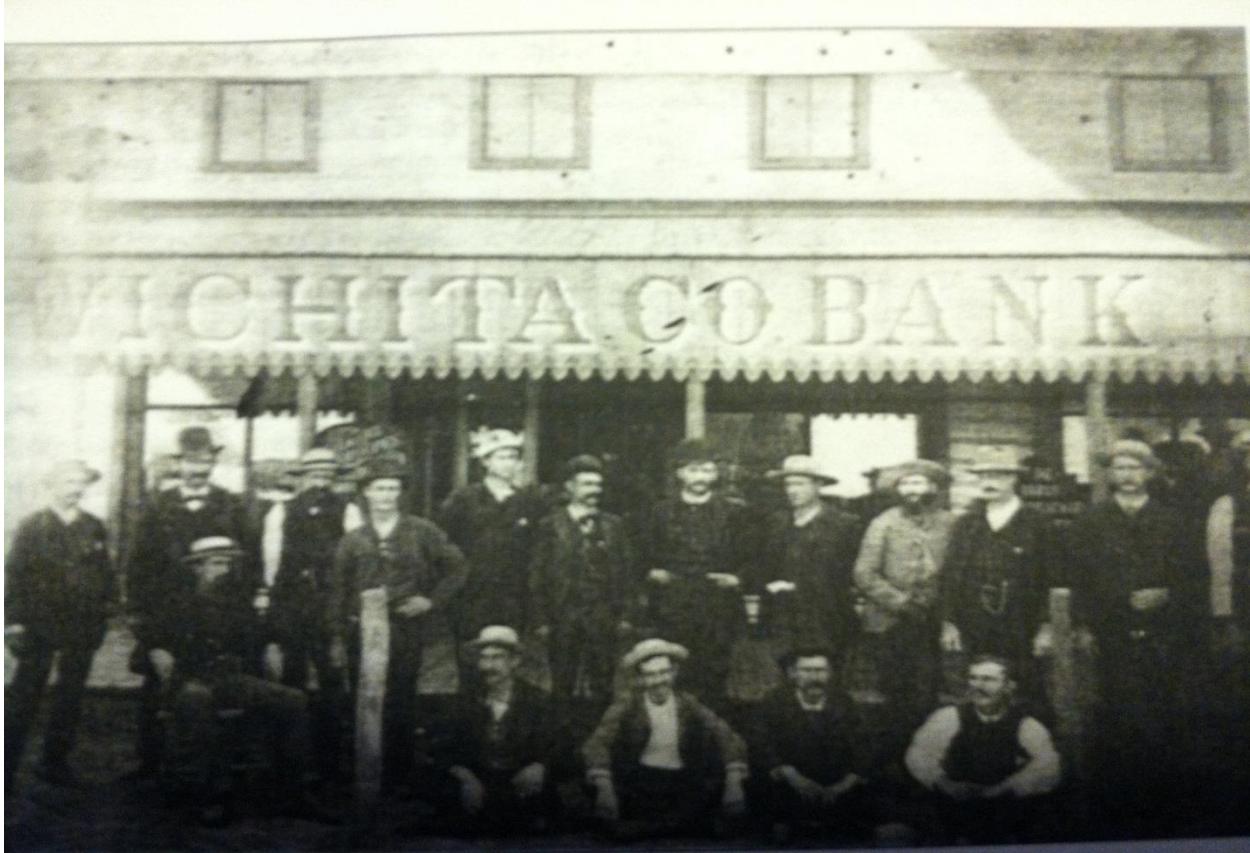
Figure 3: A photograph of the lawmen of Dodge City, KS after the county seat fight in 1887. Date of picture is unknown.