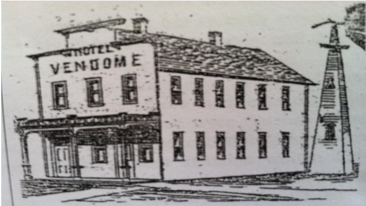
Figure 1: A sketch of The Hotel Vendome, Date Unknown. Caption: The Hotel Vendome was the first building erected in Coronado, Kansas in 1886.

So intense was the rivalry that one local person wrote, 5 “The people of the two towns love each other as his satanic majesty is said to love holy water.” By the spring of 1886, Coronado began to appear as a threat to Leoti for who would win the county seat. In under a year, Coronado had grown from a desolate area to a town with two hotels, two banks, hardware stores, a post office, and a bakery. Both towns had been started in 1885, but due to the fact that Leoti had been established first in the entire soon-to-be-county, as well as being geographically centered in the county, people who were from around the area felt that Leoti should be the county seat. Coronado and Leoti were twin towns; Leoti had just barely beaten Coronado to the first land claim for a town.