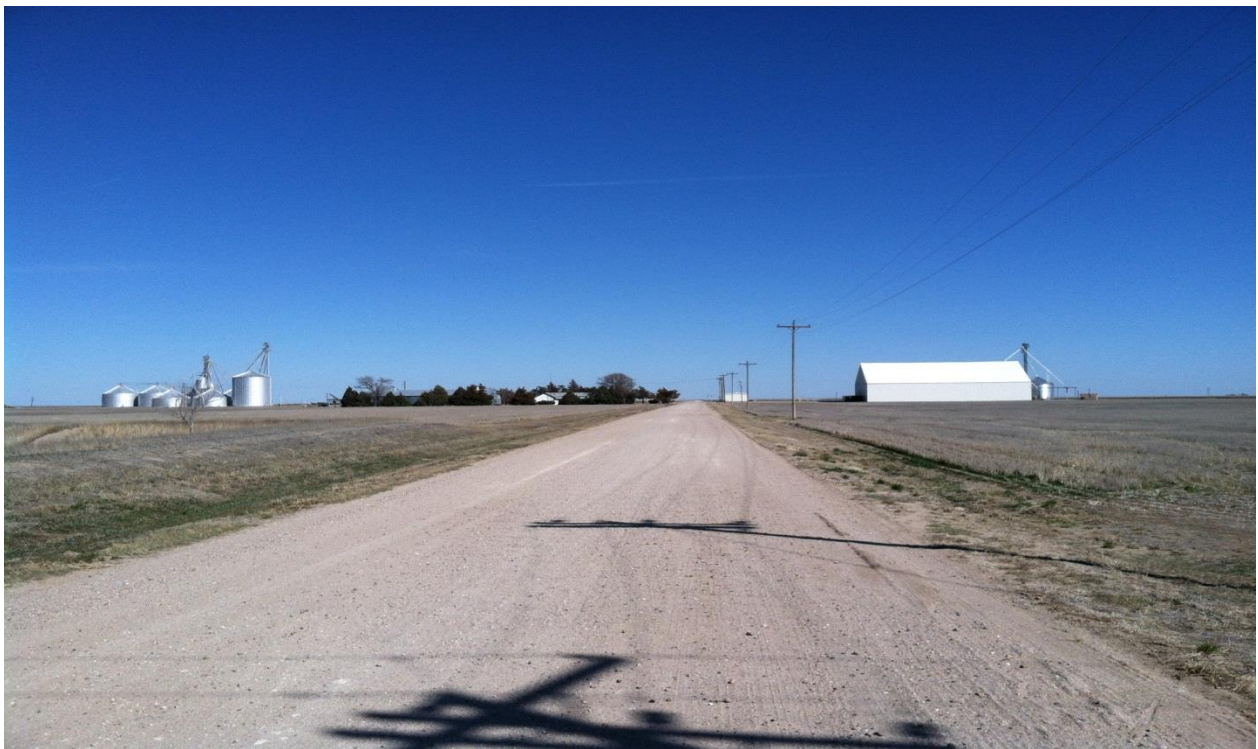
Figure 5: A photograph of Coronado, Kansas today, March 29, 2013.

to its neighbor, Leoti was not as carefully architecturally engineered as Coronado, and because of its recent win as county seat, town planners were offering to buy buildings from Coronado and have them moved into Leoti. Just over thirty years after the gun fight, Coronado was similar to what it appears as today with a farm house and an elevator. 13 Today Coronado is currently owned by the E.S.E. Alcohol Corporation located in Leoti. Once a fierce competitor with its neighbor towns, a stereotypical western shoot up town, and a place of new opportunity, Coronado should be remembered not for the gun fight, but as a sign of how much effort it took to make a living in early western Kansas.