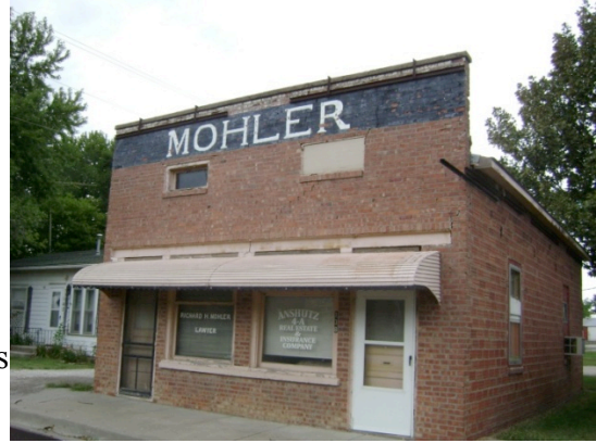
Figure 4: The former location of the Harveyville Monitor . It is currently home to Mohler Law Office and 4-A Real Estate.

Some other businesses that are currently available in Harveyville are Jepson’s Pottery, a flower shop called A Special Event, and Bell Wildlife Specialties, which offers guided and unguided tours, lodging, and full service taxidermy. There is also Bob’s Repair & Service, Country Bumpkin Pumpkin Patch,