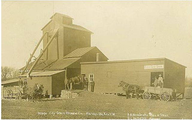
Figure 2: The Osage City Grain Elevator Co. in roughly 1907.