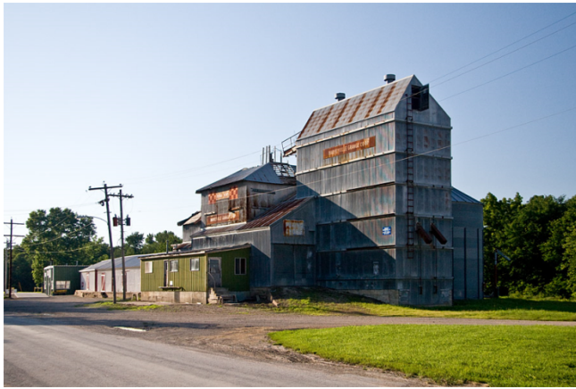
Figure 3: The co-op in the early 2000s. The grain elevator has been torn down and the building is now owned by the Harveyville Seed Co.

stone, brick and plaster work. There was also a dry goods store, along with three grocery stores, a meat market, a drug store, a furniture store, two hardware stores, a tack shop, a hotel, a livery stable, a lumber yard, two real estate offices, and two restaurants. There were two elevators; now, the Harveyville Seed Company is located where the Osage Grain & Elevator Co. used to be. In 1903, the Harveyville Monitor was started as the first newspaper in town. There is not a town newspaper anymore, but there