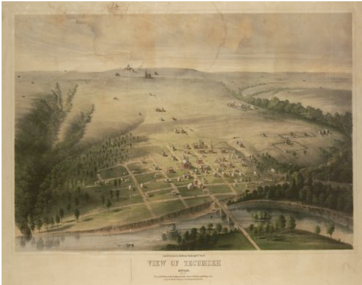
Figure 2: An 1859 lithograph depicting the town of Tecumseh.

After Kansas entered the union and the Civil War ended, Tecumseh continued to survive. The 1870 Agricultural Census provides a glimpse of the Tecumseh economy during this period. According to the Census, as of June 1, 1870, Tecumseh boasted: 8,828 acres of improved land, farms valued at $605,000 (equal to over ten million dollars in 2010), total annual wages of $16,097, and total livestock valued at $109,294 (equal to approximately 1.8 million dollars in 2010). 5 That spring, farmers had collected 5,402 bushels of wheat, among other harvests. 6