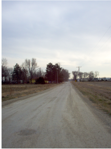
Figure 2: Swamp Angel Road. Looking South towards the Kansas River. Note the few buildings gathered where the town site or school may have been. Fall 2010.

As far as any historical reference attributed to Swamp Angel, the only indication as to what the location refers to has come from historical interpretative maps by Huber Self. In his book The Historical Atlas of Kansas and in a map provided by the Riley County Historical Museum (Attachment 1), Self identifies Swamp Angel in both instances as an un-incorporated place and as a school district (Attachment 2). 4 This could be interpreted to mean that this community was historically focused on a rural school district and one of Kansas' many one room school houses.