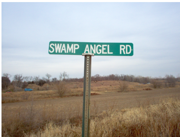
Figure 1: Swamp Angel Road sign. Located south of Highway 24 along Military Trail Road, Pottawatomie County, Kansas. Fall, 2010.

What is known is that Swamp Angel is a modern un-incorporated place with only the tell-tale road sign (Figure 1) to establish the location of where a settlement may have been. The place itself consists of a road (Figure 2) leading between five houses and a grain silo, crossing the railroad tracks and leading across the floodplain where it dead ends at the Kansas River.