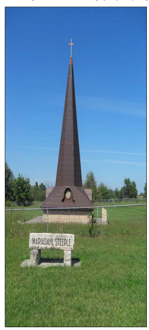
Figure 3: Here is the Mariadahl Lutheran Church Steeple which was preserved and relocated to Olsburg Kansas. In this picture you can really see how well the townspeople have cared for it.

As talk of the installation of the Tuttle Creek Dam came to the forefront of Mariadahl's community in 1955, people began to gather in groups and discuss how to keep the Tuttle Creek Dam out of their home. "Valley people gathered in silent groups too stunned to speak, too heartsick to