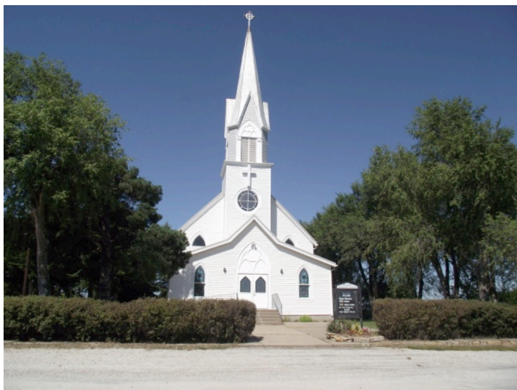
Figure 1 Church : St. Paul's Lutheran Church established 1875.