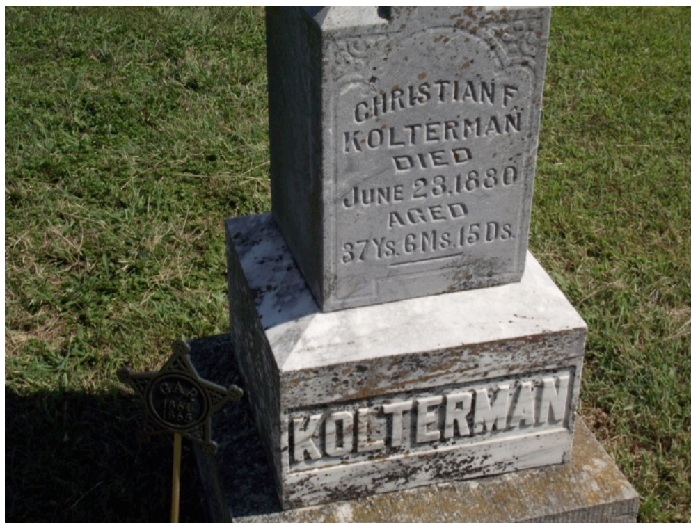
Figure 3 Gravestone : Christian Kolterman's Gravestone – Civil War Veteran.