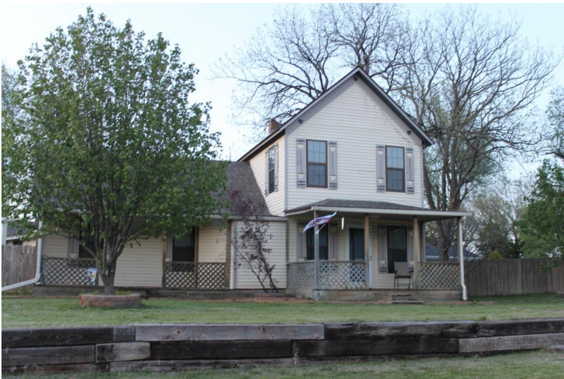
Figure 7. Photograph of the old Niles Post office and telephone exchange in present day. The old house is recognizable as what used to be the information hub for Niles.