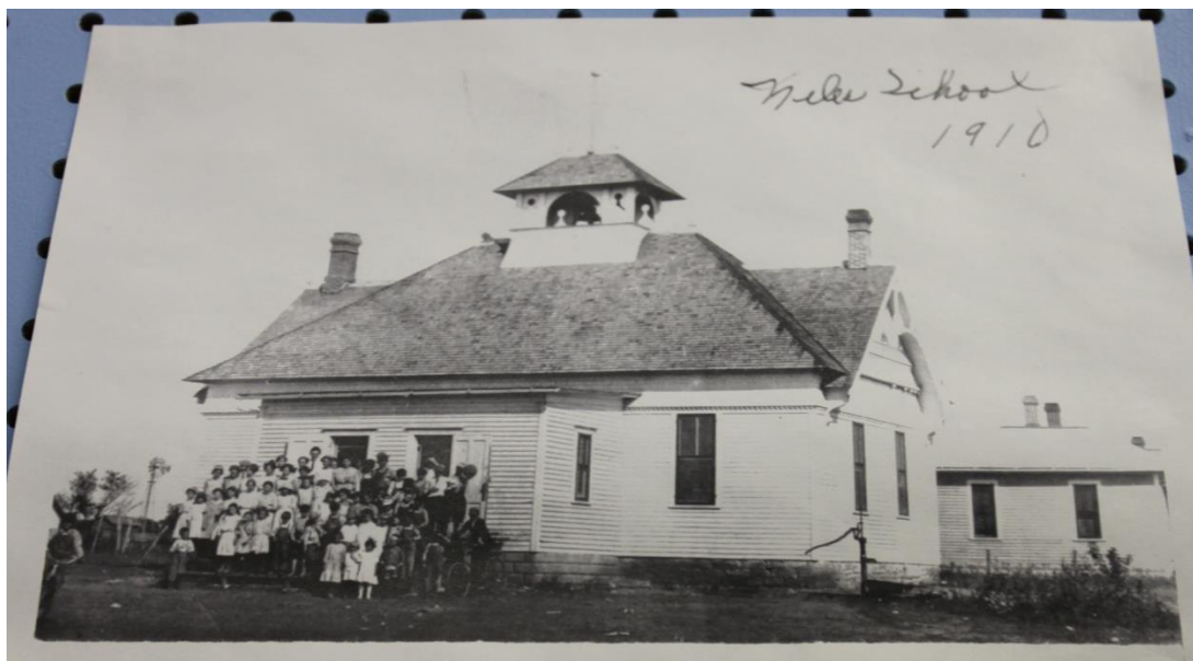
Figure 8. Photograph of Niles School. Students stand outside the school located on Bridge Street, presently Arrowhead Road, in Niles, Kansas. The school boasts two chimneys and an elaborate bell tower. Dated 1910.

Even though the population had peaked early on, Niles continued with its small town happenings. While school was once held in a dugout, eventually a schoolhouse was built and the children had access to education in the town itself.