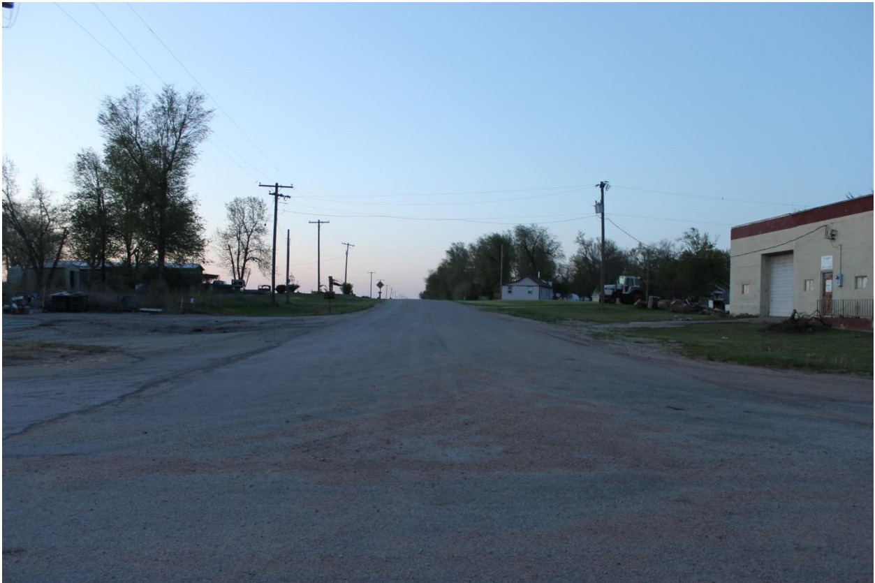
Figure 10. The view of what used to be Main Street, Niles, Kansas. A vast difference of what used to stand.