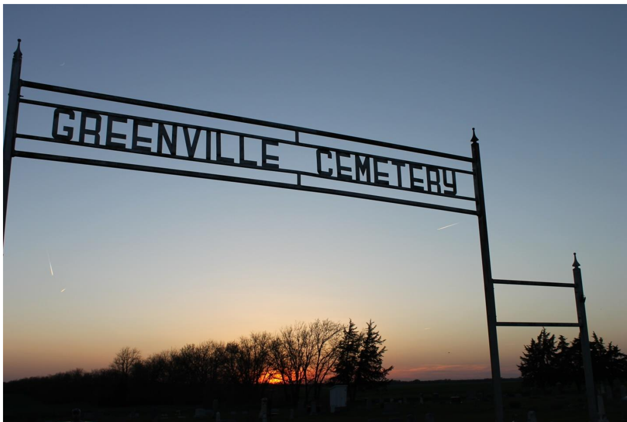
Figure 5. Photograph of the sun setting on Greenville Cemetery off of 250 th Road, previously Main Street, in Niles, Kansas. The cemetery holds grave markers from as far back as 1868.

The Casebeers, Thomas and Elizabeth, were also extremely influential in the upbringing of Niles. The Casebeers offered to give a portion of their land to the town of Niles to use as the cemetery. Today, their land is still home to Greenville Cemetery on what used to be Main Street in Niles.