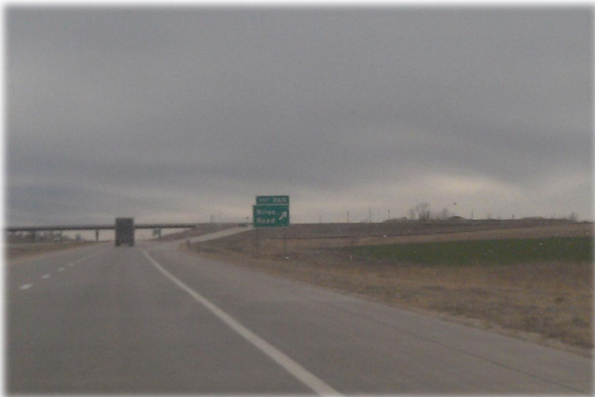
Figure 1. Photograph of Exit 260 that marks the route into Niles, Kansas. Today, for most people this is nothing more than an exit. To a small few, it is the road that leads to home.