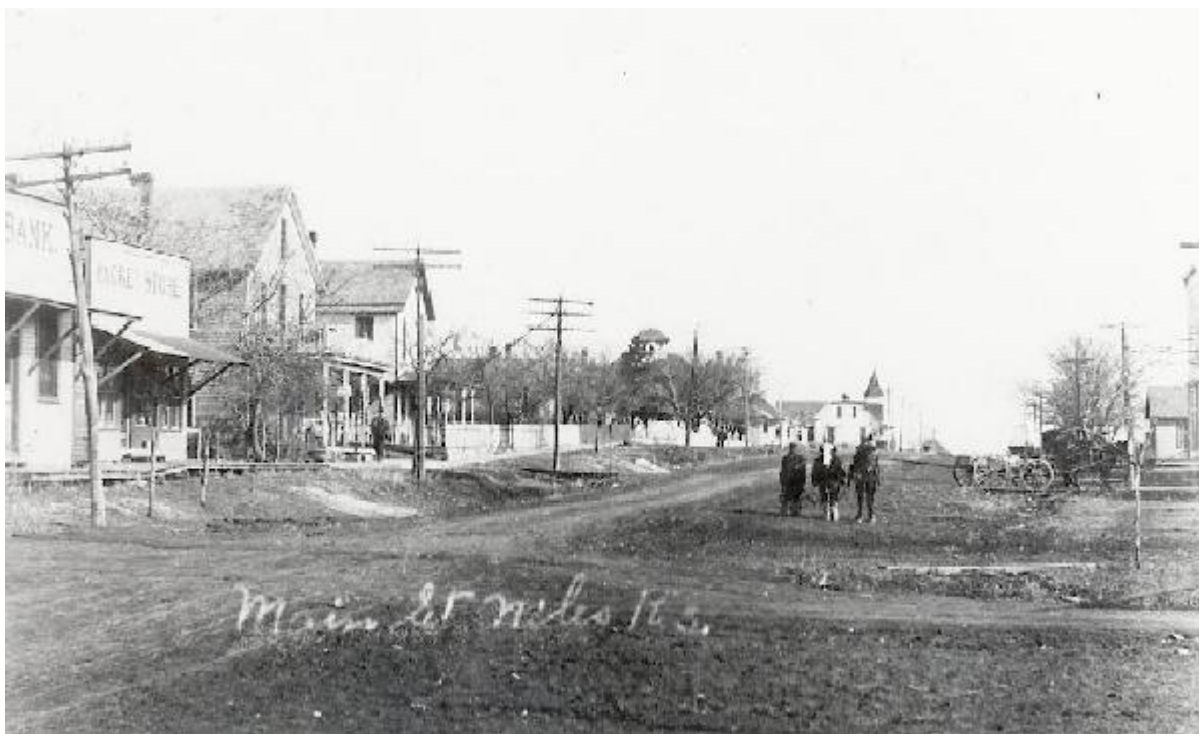
Figure 2. Photograph of Main Street, present day 250 th Road, in Niles Kansas. One can see the bell tower of the school above the tree tops and the church in the distance. To the left is the Bank, General Store and Hotel set along the wide street. Circa 1900.