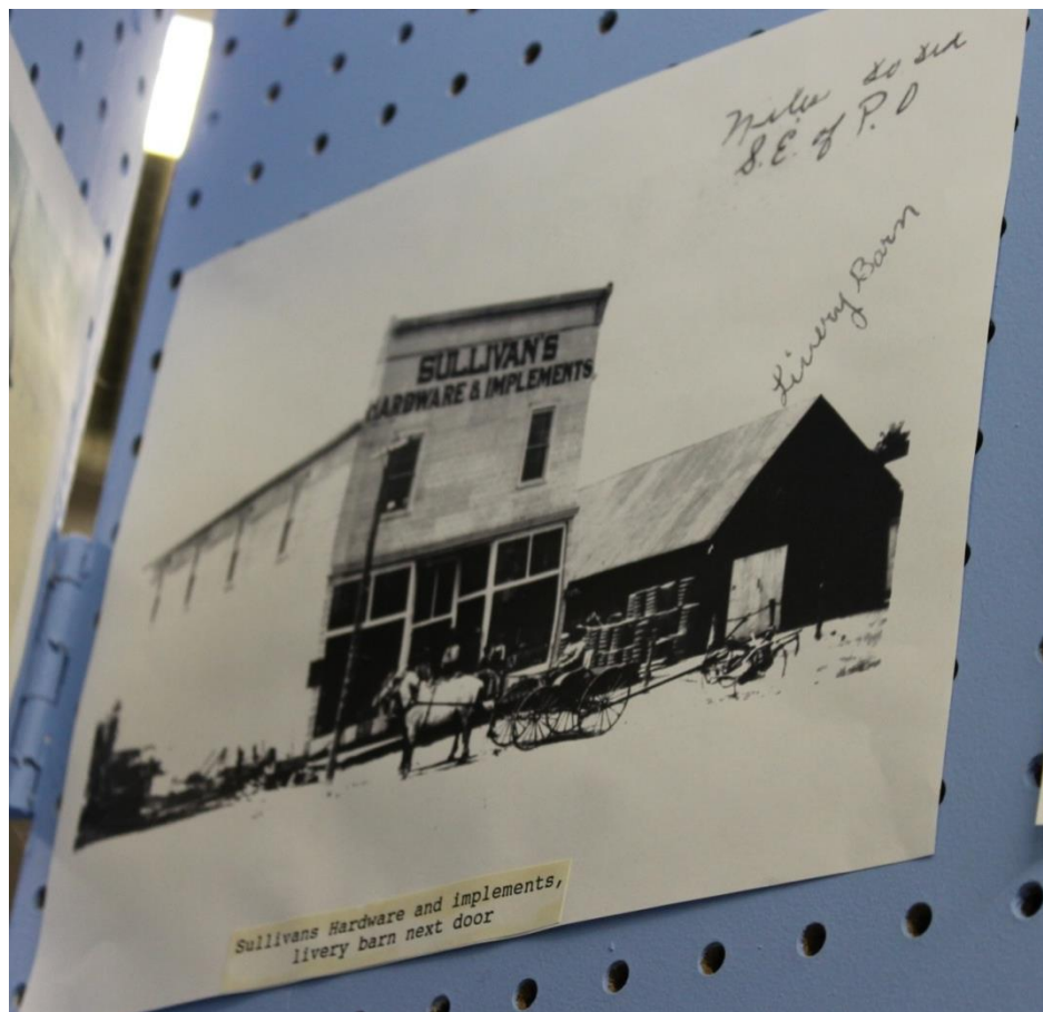
Figure 9. Photograph of Sullivan Hardware and Implement Store. The traditional flat front building was located on Main Street and shows my family's involvement in the history of Niles, Kansas. Circa 1900.

While there is no big story or event that caused Niles to lose momentum, the story is still an important one.