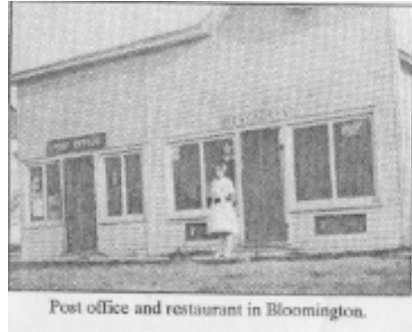
Figure 11. Photo of the post office and restaurant in Bloomington from the “Bloomington Scrapbook,” courtesy of the Carnegie Research Library in Osborne, Kansas.

The building that the post office and restaurant resided in is one of the few structures, along with the old stone schoolhouse and part of the elevator, that remains standing today. A picture of it is shown below in Figure 12.