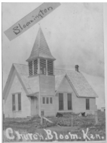
Figure 13. Photo of the Bloomington Church, which was non-denominational, from the “Bloomington Scrapbook,” courtesy of the Carnegie Research Library in Osborne, Kansas.