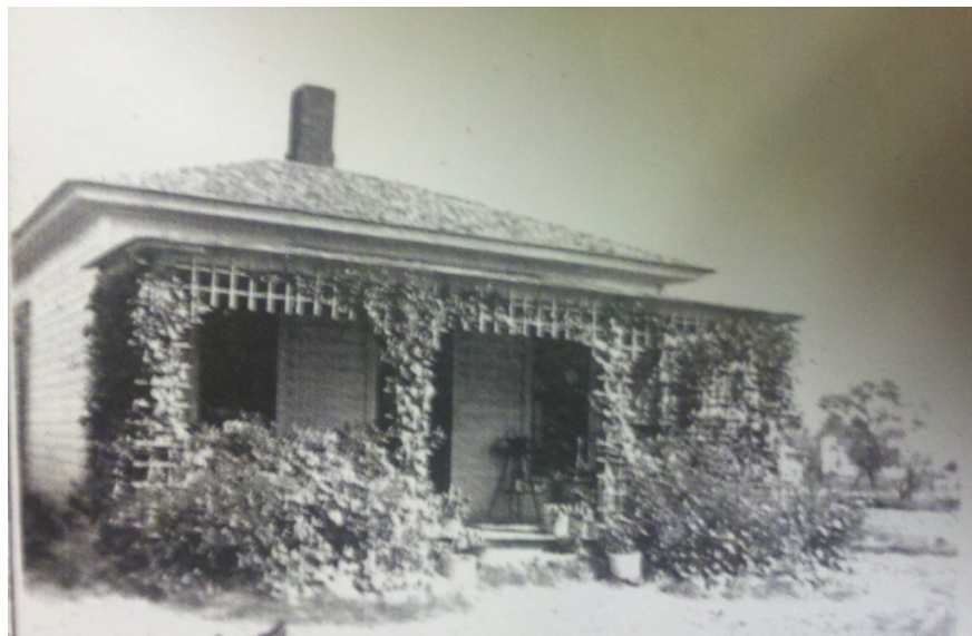
Figure 7. Photo of the phone station where Mrs. Shaw would connect people via switchboard to other residents in the community.

The school, as mentioned earlier, was built in 1878. In 1880 there were fifty-three students, and by 1882 there were sixty-five, prompting one of the first known uses of modern class scheduling by a rural one-room schoolhouse. The younger students attended school during the summer months while the older students attended school during the winter months. In 1882-1883 a new school building was built to handle this educational congestion. 5 The new wooden schoolhouse was used until the school was closed down and the children of Bloomington started going to school in nearby Osborne. Nelson Manufacturing then began using the schoolhouse, where they built wheel weights and centrifugal pumps. However, the building burned down and is no longer there today.