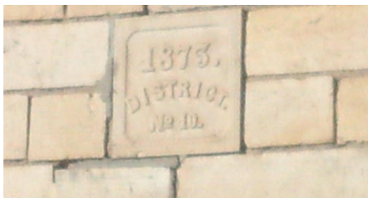
Figure 10 Photo of brick that shows when the old stone schoolhouse was built. Photo taken by Alan Mick on December 12, 2012.

Bloomington had one restaurant, and it was connected to the post office, shown in Figure 11.