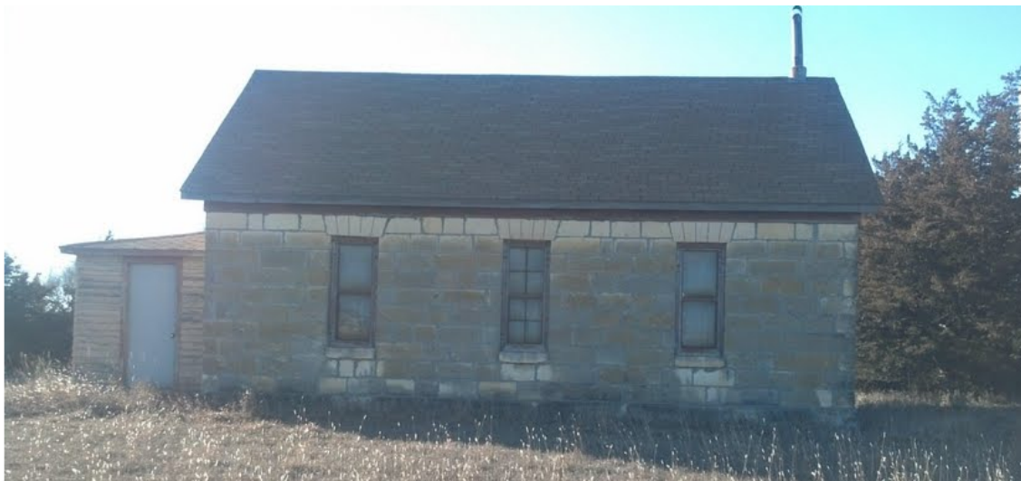
Figure 9. Photo of the old stone schoolhouse that still stands in Bloomington today. This building was used for the 22 Club meetings once the new school was built.

would get together to socialize, talk about what was going on in the community, and play cards. Eventually the group disbanded, but before their closing they had a huge meal and invited the entire community to come and partake. The original stone schoolhouse still remains intact today and is shown in figures 9 and 10 below.