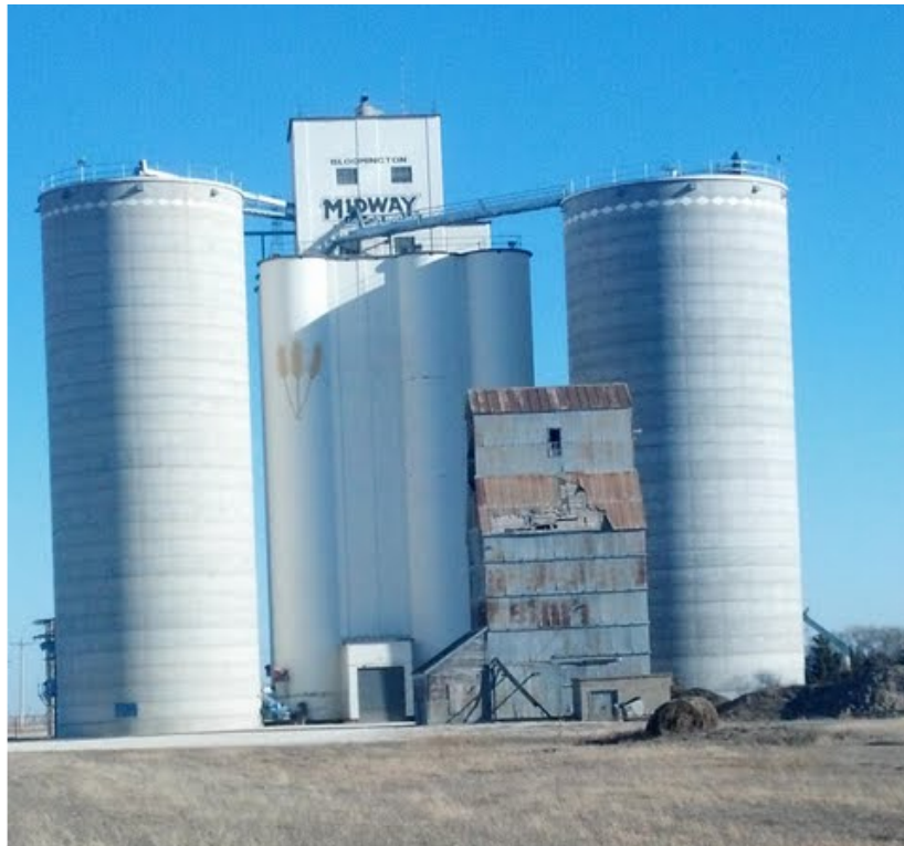
Figure 6. Photo of elevator in Bloomington that stands today. Picture taken by Alan Mick on December 12, 2012.

The elevator is the only business that currently operates in Bloomington today, which shows how important agriculture was and is to the town.