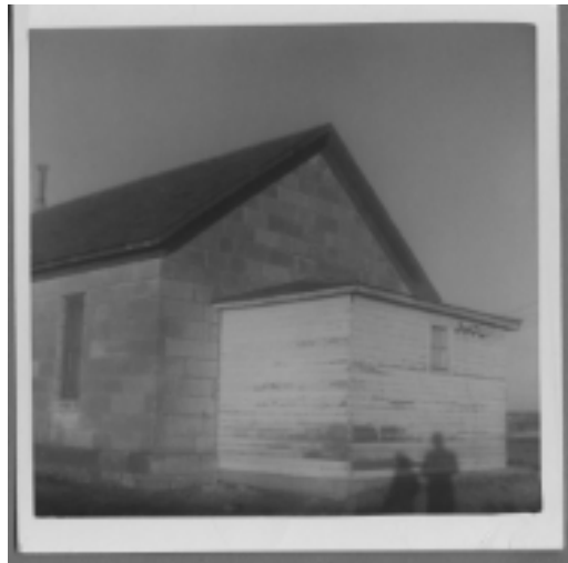
Figure 1. Photo of the first stone schoolhouse built in Bloomington.

On May 30, 1872, the Tilden Post Office was opened and Cyrus C. Tilton became the first postmaster there. Shortly afterwards, School District 10 was organized. Figure 1 shows the first schoolhouse that was built.