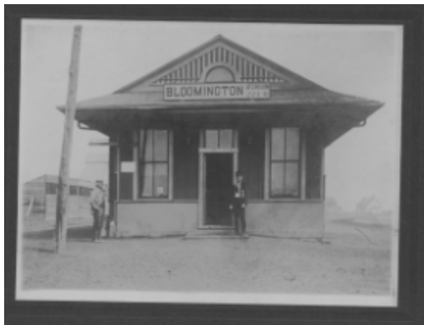
Figure 2. Photo of the old depot that was located in Bloomington.

Figure 2 shows the old depot that was located in Bloomington.