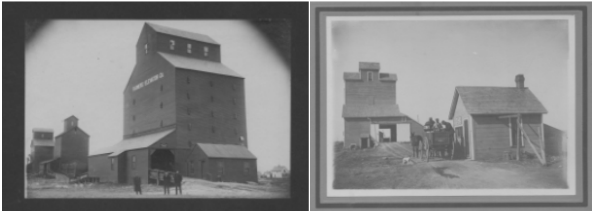
Figures 4 & 5. Pictures of the grain elevators in Bloomington.

Figures 4 and 5 show what the grain elevators, where the local farmers hauled their grain, looked like at two different time periods in Bloomington.