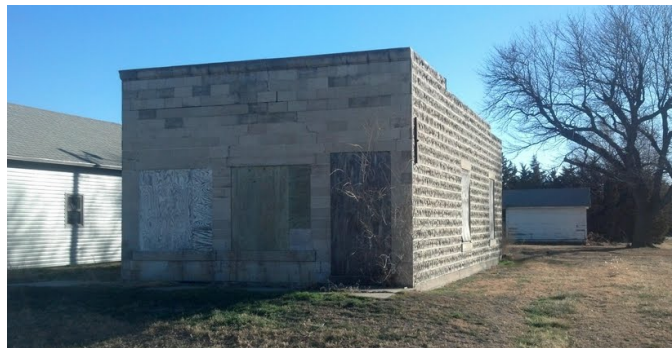
Figure 12. Present-day photo of the building that once housed Bloomington’s restaurant and post office.

The building that the post office and restaurant resided in is one of the few structures, along with the old stone schoolhouse and part of the elevator, that remains standing today. A picture of it is shown below in Figure 12.