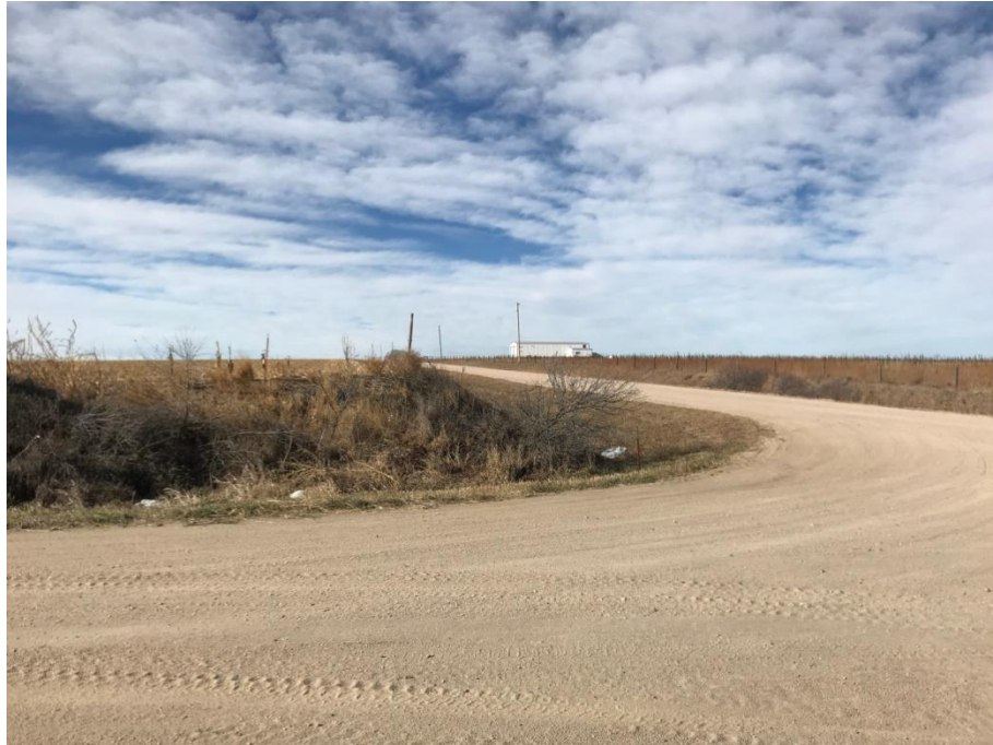
Figure 2: Raysville, Kansas, looking west off 1300 Rd. Photo by Hannah Hutchinson, November 26, 2017.