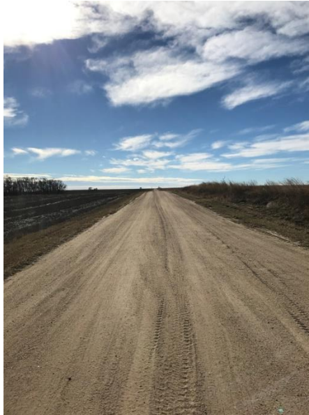
Figure 3: Rayville, Kansas now a part of Long Island, Kansas. Photo by Hannah Hutchinson, November 26, 2017.

Rayville. The September 8, 1887 edition of The Logan Republican records a roster of soldiers, including one with a home address in Rayville. 5