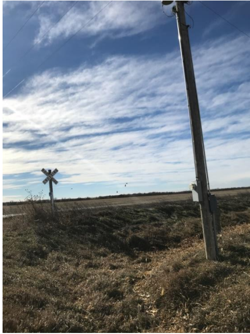
Figure 4: Rock Island and Burlington Railroads. Photo by Hannah Hutchinson, November 26, 2017.

1929 there was no trace left of Rayville; the location of the former town is now a part of Long Island, Kansas.