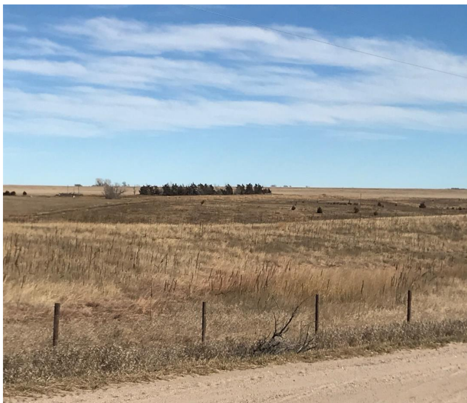
Figure 1 Where Rayville once stood. present day.