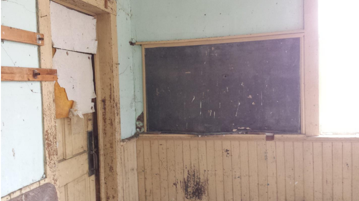
Figure 6. Photograph of one of the two chalkboards still on the walls of the abandoned America City school building. This chalkboard hangs next to the back door in the north half of the main classroom.