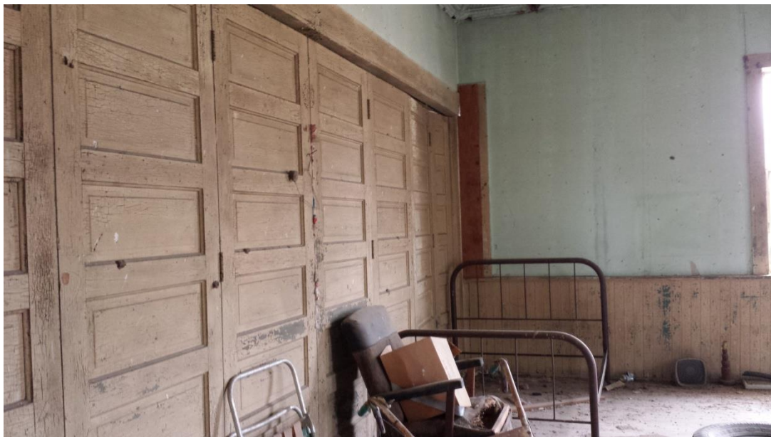
Figure 7. Photograph of the convertible wall made of folding doors that divided the main room of the school in half. The building still contains a variety of furniture left behind by an owner who attempted to convert the structure into a home.