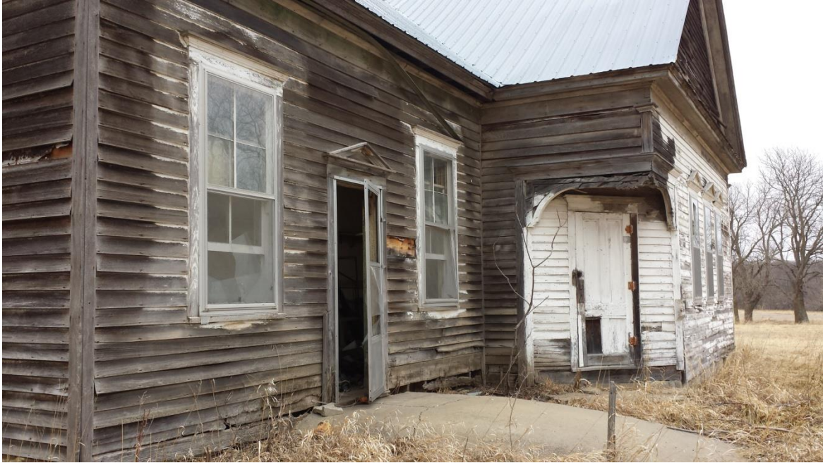
Figure 4. Photograph of the south side and probably main entrance of the America City school building. The roof appears to have been redone with tin sheeting at some point, which has preserved the structure fairly well for being abandoned for decades.

When it came to other businesses in America City, the town's location is revealed to be much more purposeful than just to be near a river. The "Parallel Road" that area residents refer to today was actually originally an overland trail. The trail ran across the state from Atchison to Denver in a mostly straight line, so it was called the Parallel Road trail. 22 Founding America City along the trail immediately established it as a part of the carrying trade, which involved all aspects of transporting people and freight west across Kansas, since railroads hadn't reached that far yet. Being placed along the trail provided traffic for America City businesses, as well as a need for specific kinds of goods and services. By 1878, there were three general stores, a hotel, a harness and shoemaker, a wagon-maker, a horse dealer, and a blacksmith shop. All of these early