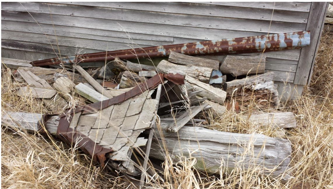
Figure 5. Photograph of the church steeple that was removed from America City's church when it was moved from its original location. The inside of the church contains garage and shop equipment along the walls, but the original architecture and wainscoting are still apparent.

addition to the large, hilly cemetery northeast of the original town site as it appeared on the original plat map, the only remaining structures of America City's existence are the original church and a deserted school. At some point in time, someone had attempted to convert the school building into a home and used the church structure as a garage, but both buildings have long since been abandoned. This practice of converting structures for new and totally different purposes is commonly seen across rural Kansas, and often extends the lives of these buildings for at least a few more years. In this case, the church's steeple was removed and now lies decaying next to the building, while the structure itself is in surprisingly solid condition, as shown in Figure 5 below.