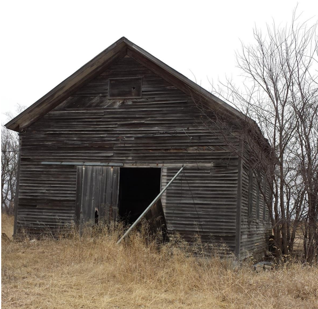
Figure 3. Photograph of the dilapidated remnant of America City’s church, which now sits next to the abandoned school building. Notice that the steeple was removed and large doors were added so the structure could be used as a garage at some point.

claimed the church, the structure was at some point moved north next to the school building where it sits today, as seen in Figure 3 below.