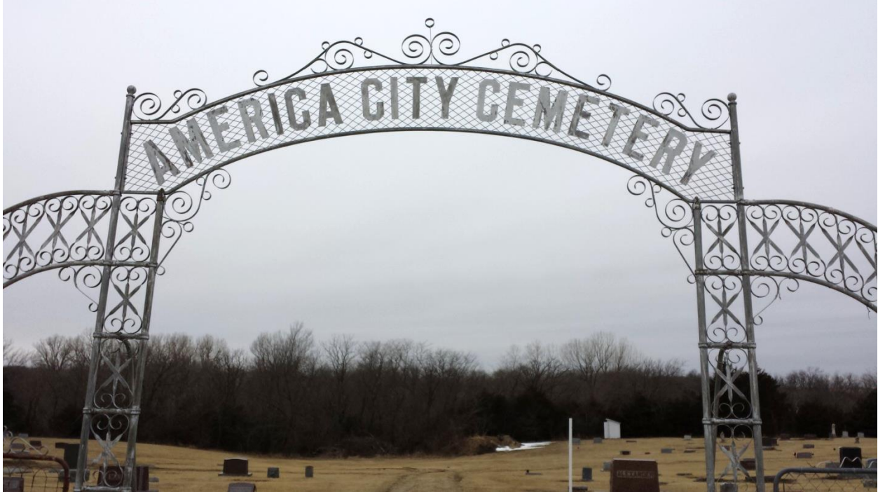
Figure 1. Photograph of the entrance of America City's cemetery, located a few miles west of Highway 63 on a gravel road in southern Nemaha County. The cemetery contains the graves of some of the earliest settlers in the county.

Jessica Hermesch Chapman Center for Rural Studies Spring 2014