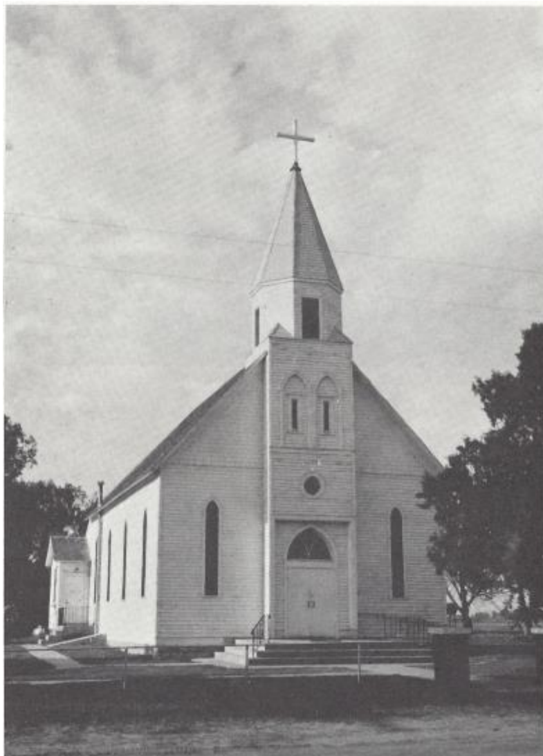
Figure 3. A photograph of St. Louis Catholic Church taken in 1971. The church still stands today and looks much the same as it does here, nearly 50 years earlier.

Waterloo was also home to St. Louis Catholic Church, built in 1882. Unfortunately, this first building was blown away before the dedication but another was built in its place. With more Catholic families moving into the area in following years, a larger building was needed and the present-day church, which can be seen below, was constructed in 1901. Next door, a Catholic school house was built in 1910 and classes were taught by the Sisters of the Sorrowful Mother until the school's closing in 1966.