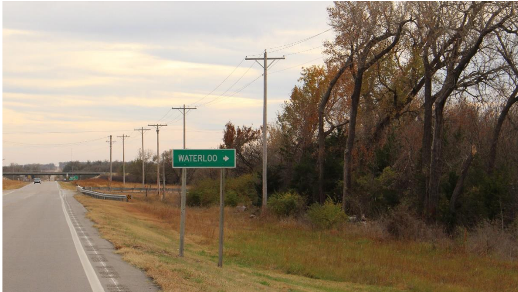
Figure 6. Heading south on Highway 17, a sign points passersby towards what remains of the town of Waterloo.

Today, the town of Waterloo still exists, although many of the structures are gone. The Endicott family – one of the first to arrive – is the only original family still residing there. Both schools still stand although neither are operational and the public school has since been turned into a home. The Riggs Arboretum still exists, however, and is overseen by descendants of the original owner and operator, J.W. Riggs. It is no longer used as a nursery with trees for purchase but has developed into a beautiful forest, a living memory of the man who started it all. Below, several pictures can be seen of Waterloo today.