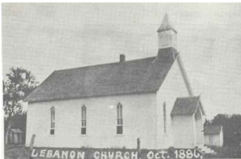
Figure 4. A photograph of Lebanon Methodist Church taken c. 1915. The care taken in the construction of this building by the residents of Waterloo can be seen in the church's beautiful details.

Finally, a third denomination established itself in Waterloo with the building of Lebanon Methodist church in 1886 on land purchased from J.P. Cawthon. Not much else is known about this church except that it was closed in 1929 and that the building was then moved to Abbeyville. 8 A photograph of the building when it was still located in Waterloo can be seen below.