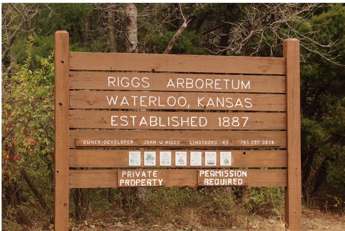
Figure 8. A sign welcomes visitors and reminds them of the Riggs Arboretum. Today, community members hold work days to clean and update the extensive network of trails that cuts through the arboretum.