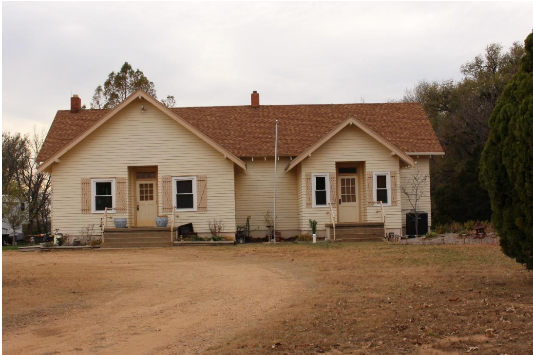
Figure 9. A photograph of what used to be the public school house in Waterloo. Today, the school has been converted into one of the few remaining homes in Waterloo.