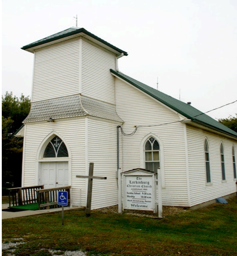
Figure 2. The Larkinburg Christian Church was established in 1903 and still stands today. Larry Hornbaker, Larkinburg Christian Church , October 15, 2009, digital photograph. Source: http://ke2013.smugmug.com/Dare-To-Do-Dirt/North-East-Kansas/Atchison-County-Dirt .

, and a Catholic church. St. Agatha's Catholic Church was a popular choice for the residents and in its prime had over forty families in attendance.