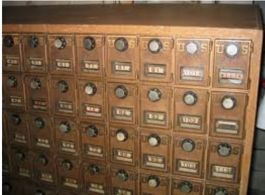
Figure 2: Example of the postal boxes that would have been used.

Schlappi, granddaughter of Daniel and Emma Garrison, recalled the old post office letter boxes stored in the tool shop on the farm.