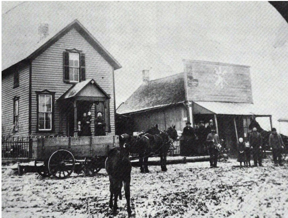
Figure 8: Scanned photograph of the Clearfield general store and post office. ca. 1900