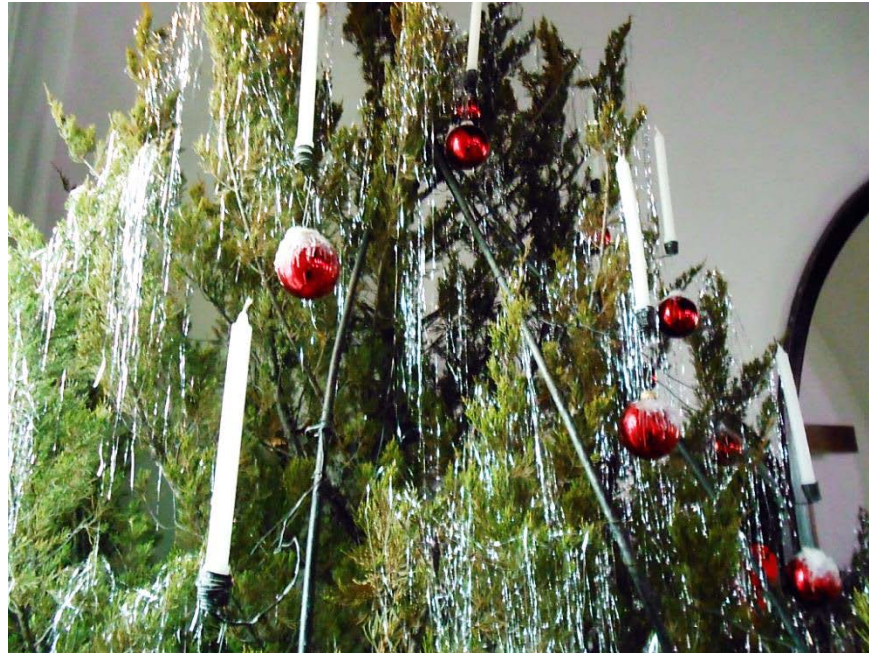
Figure 3: A photograph of the Christmas tree focused on the German-tradition wire candle fram. ca. 2013 In the past, the tinsel for the tree was collected to be reused every year.

until the mid 1900s when a switch to English was made. The church services were in German up until World War I, when again English was adopted.