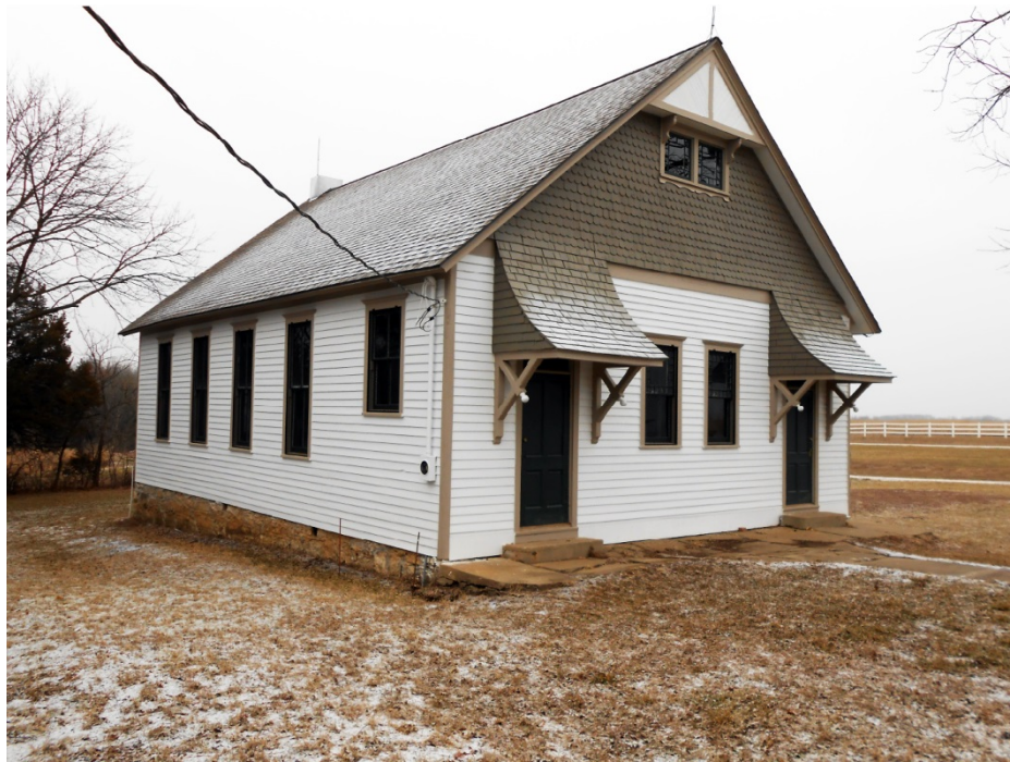
Figure 6: The Clearfield School which is currently under renovations. ca. 2013

Persistence of a town is defined as ten percent of families remaining after fifty years. 16 Early family names found within my research include Breacheisen, Meeder, Kramer, and Hausman. Later additions to the community are the families Sturm, Schendel, Selzer, Rohe, Breithaupt, Dechwa, and Klein. 17 Looking at the 1980 community directory, one hundred years after the church building was constructed, many of those names remain. There were 26 Brecheisens registered, 17 of whom were members of the church; five Hausmans, three Meeders, five Rodewalds, a Schendel family, three Selzers, and nine Sturm members. 18 The number of families still found in the area is a significant part of what keeps this community strong. They keep traditions going, like the annual Christmas tree and German celebration, as well as preserving many heirlooms from the community's past.