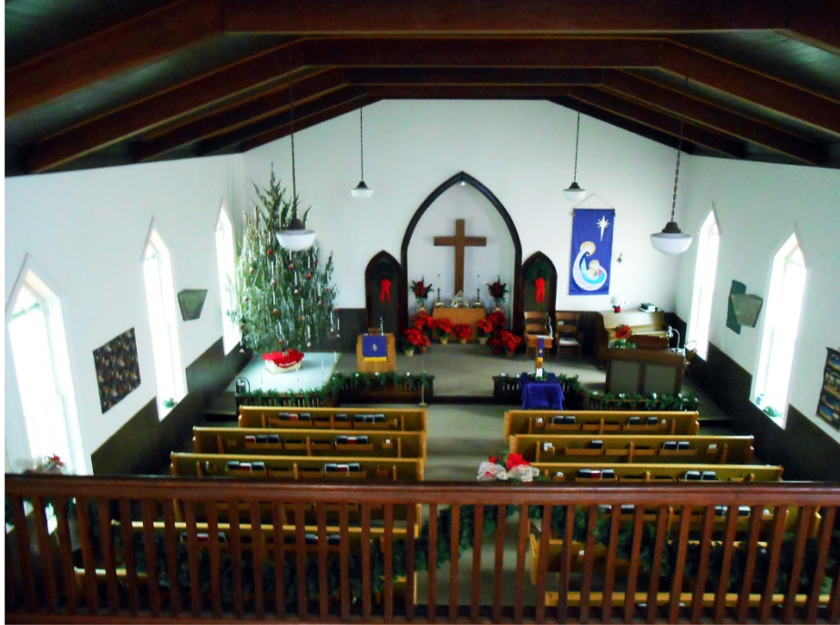
Figure 7: Clearfield Church sanctuary decorated for Christmas. ca. 2013