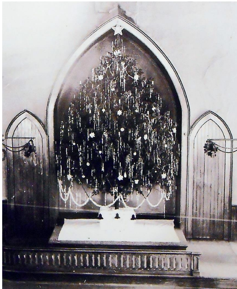
Figure 5: A vintage photograph of the Clearfield Church Christmas tree. ca. 1915.

The late nineteenth century was the high point for Clearfield. By 1910, the population of the town was less than twenty. 13 In 1908, the school house was moved one mile west. It continued to be used as a school house until the mid-1940s when the district was unified with the Baldwin School. 14 The school house continued use as the meeting place for the local Grange, formed in 1907. 15 The Grange disbanded in 1990 and the school house was left for several years. Recently receiving a grant, the Clearfield School is being renovated to become a historical site in Douglas County, as shown in Fig. 6 (page 8).