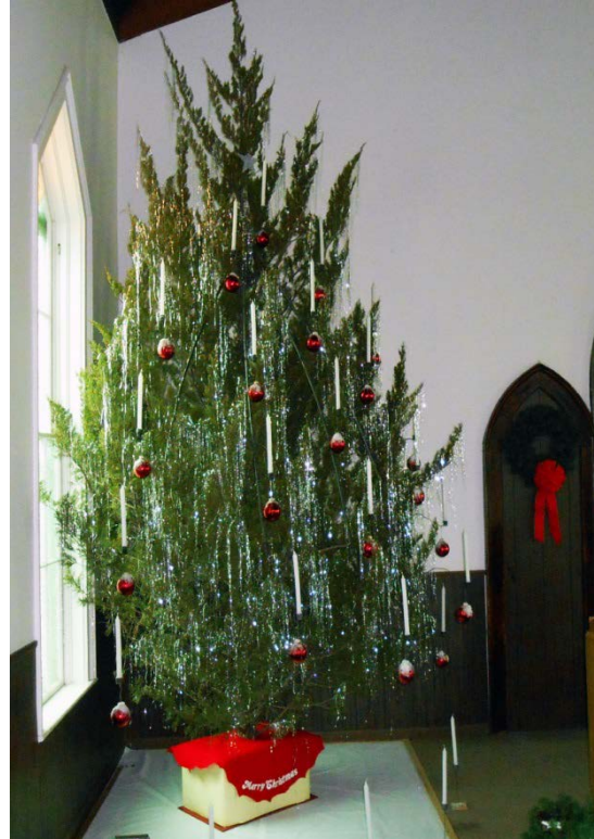
Figure 2: A photograph of the Clearfield Community Christmas tree. ca. 2013

Kansas was open to settlement, the Shawnee tribe was given this land south of the Kansas River stretching out west to the Manhattan area. 3