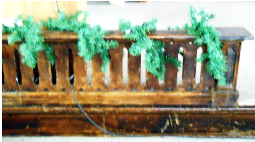
Figure 4: A photograph of the hand-carved railing in Clearfield Church, decorated for Christmas. ca. 2013. The railing now opens in the center of the sanctuary. This was modified in 1972 when the sanctuary was remodded. 9

changed from the original arrangement, as shown in Figs. 4 and 5 (page 7). The pews were divided in the middle with men and women sitting on opposite sides. 8 The building has had many renovations throughout the years, adding a balcony, updating the lighting systems, and installing heating and cooling systems to make the church more comfortable.