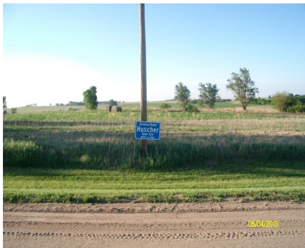
Figure 1: Photo of the Huscher Historical Landmark Site in Cloud County near Concordia, KS.