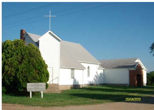
Figure 4: Photo of the Huscher United Methodist Church in Cloud County near Concordia, KS.

Also directly across the street from the Huscher Elevator is a Historical Landmark site indicating occupancy from the 1870s to 1984. This site is shown in Figure 1. Here is where most of the shops and businesses were built. Also in the area are two remaining institutions. The first is the Huscher United Methodist Church, built in the early 20 th century, shown in Figure 4. This church still provides Sunday morning sermons at 9:30 a.m. by Pastor L. Dean Thompson. The other public service that still