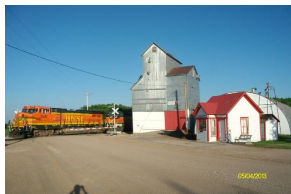
Figure 3: Photo of the Huscher Elevator in Cloud County near Concordia, KS. Taken by Dionysius Theres on May 4 th , 2012.

The first factor that led to the decline of